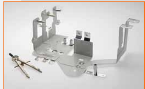
Figure 4: (Left photo) Distribution bus bar for wind mill application. (Right photo) Solar Inverter bus bar.