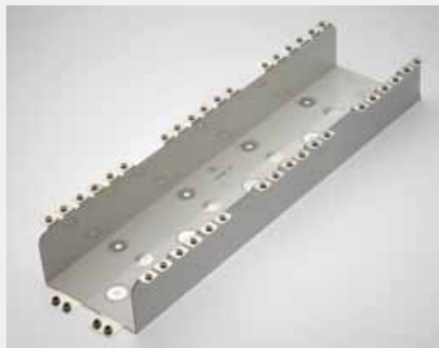
Figure 1: Mersen offers custom-designed laminated bus bars, which help in the development of power converters to achieve the lowest possible system conductivity

In high current, power electronics applications, a power distribution system containing low inductance power circuits is a critical element for safe and efficient operation of IGBT modules. If not addressed in the early design stage, the stray inductance on the total DC bus from the DC capacitor bank to the inverter devices' commutation loop can result in several undesirable consequences. Hard switching converters' excessive transient overshoots will lead to increased device temperature during switching, resulting in the need for an