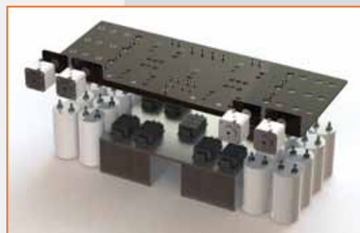
Figure 2: Assembly showing laminated bus bar, semiconductor fuses, heat sink, capacitors, and IGBTs.